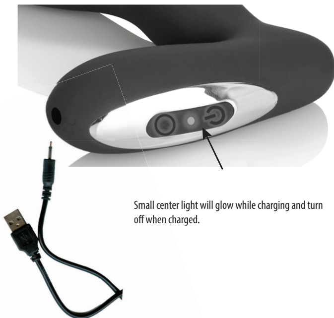
Small center light will glow while charging and turn off when charged.

Charging: Charge prior to use, initial charge will take about 2 hours if completely depleted. The small light in the center will glow while charging and turn off when charge is complete. Connect the USB cable to the USB port of your computer or other power source and the other end to the toys input port.